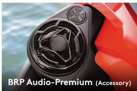
BRP Audio-Premium (Accessory)

An industry-first manufacturer-installed, truly waterproof, Bluetooth® audio system.