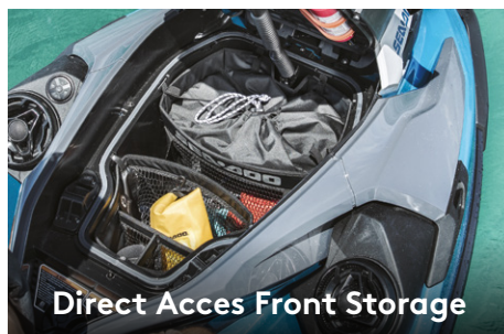
Direct Access Front Storage

An innovative hull that sets the benchmark for rough water handling, stability, and offshore performance.