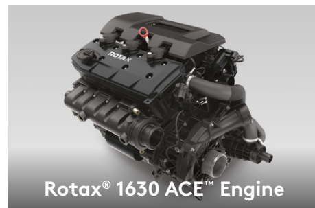
Rotax® 1630 ACE™ Engine

Large front storage area that's easily accessible from a seated position. 1