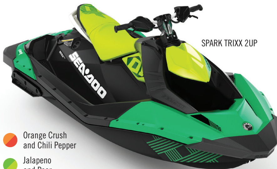
SPARK TRIXX 2UP