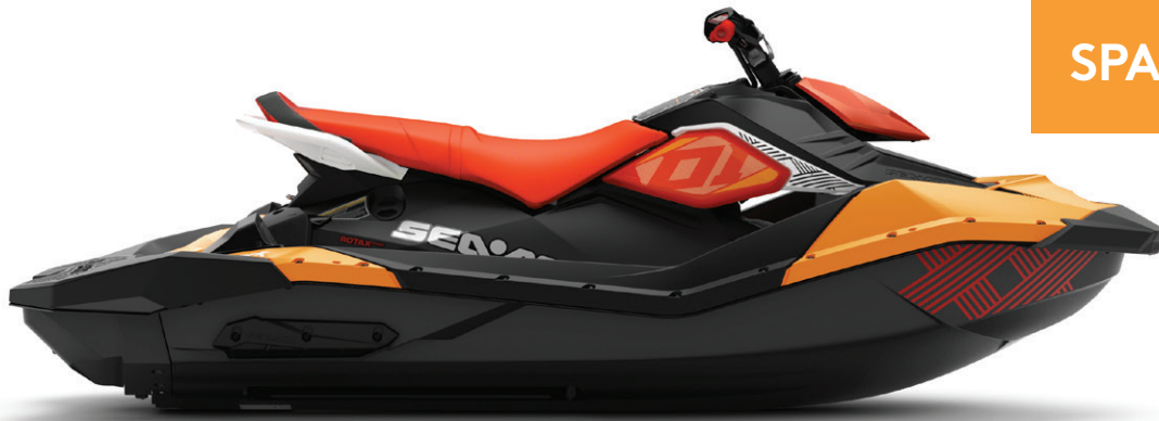
SPARK TRIXX 3UP